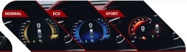
Drive Mode Selection