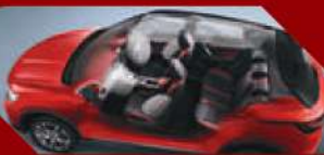
6 SRS Airbags

“ Keeps you and your passengers safe with a host of advanced safety features to detect and prevent imminent danger ”