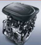
1.5L TGD, 3 Cylinders In-Line, 12 Valve DOHC, Turbocharged Petrol Engine

“ Class leading performance that has been engineered to amaze ”