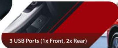
3 USB Ports (1x Front, 2x Rear)