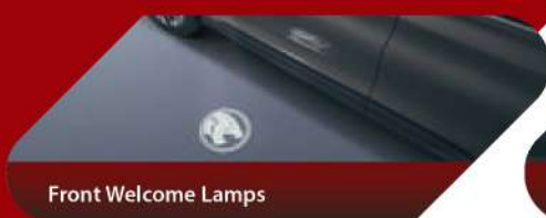
Front Welcome Lamps