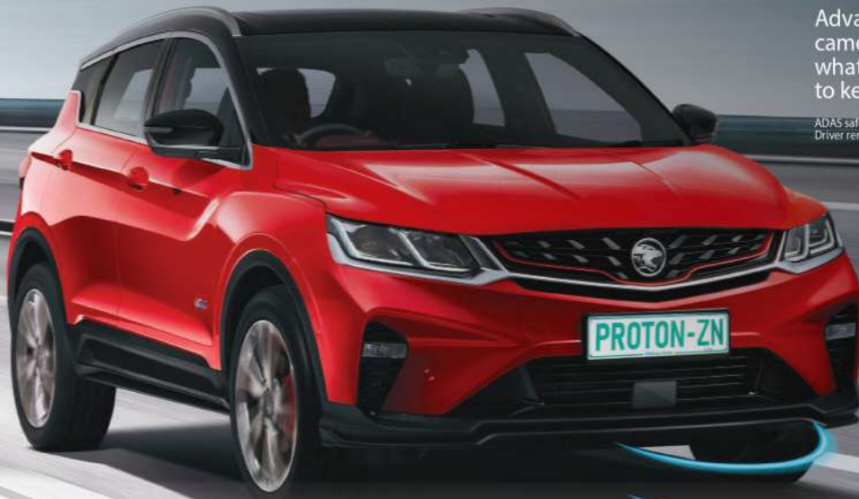
Autonomous Emergency Braking (AEB) and Forward Collision Warning (FCW)

ADAS safety features are not a substitute for safe and attentive driving. Driver remains responsible for safe vehicle operation at all times.