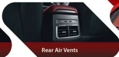
Rear Air Vents