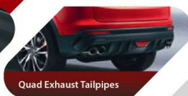
Quad Exhaust Tailpipes