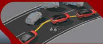
Electronic Stability Control (ESC)