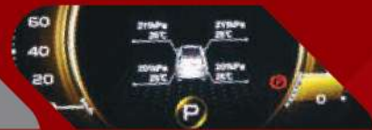
Tyre Pressure Monitoring System (TPMS)