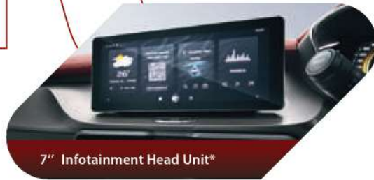
7" Infotainment Head Unit*

“ Convenience, powered by innovation and accessed by saying "Hi PROTON" ”