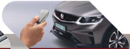
Remote Engine Start