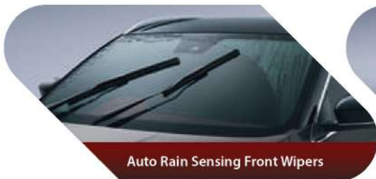
Auto Rain Sensing Front Wipers

“ Everything is designed to provide utmost comfort for you and your passengers ”