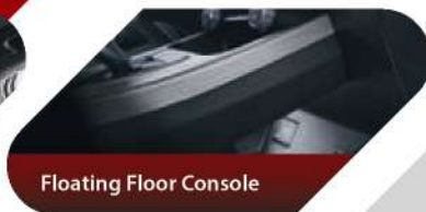
Floating Floor Console