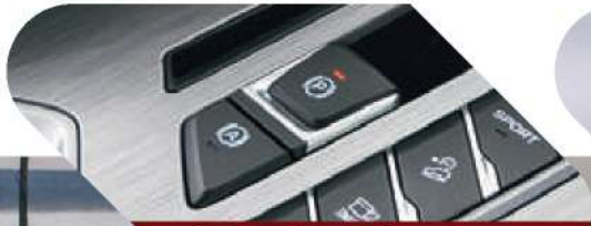
Electric Parking Brake and Auto Brake Hold