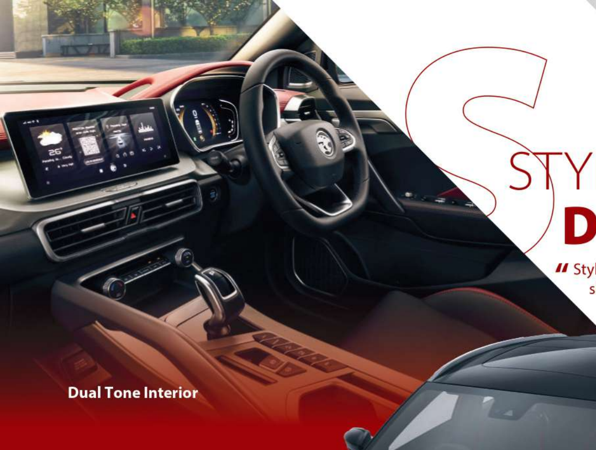
Dual Tone Interior