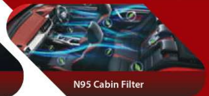
N95 Cabin Filter