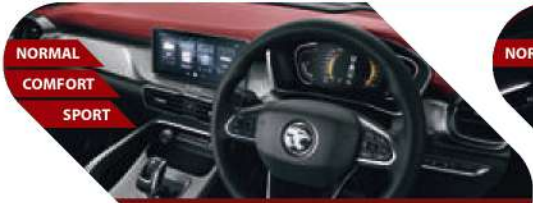
Steering Mode Selection