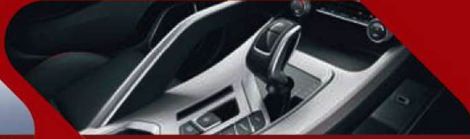
7-Speed Dual Clutch Transmission with Manual Mode