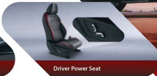
Driver Power Seat