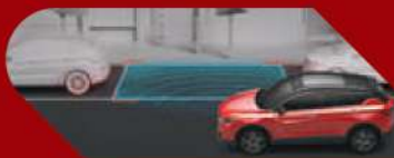
Auto Park Assist (APA)